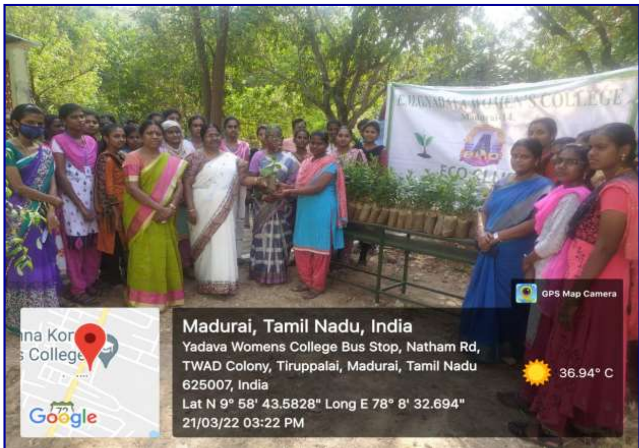
Tree Plantation & Donation of Tree Saplings - 21.03.2021