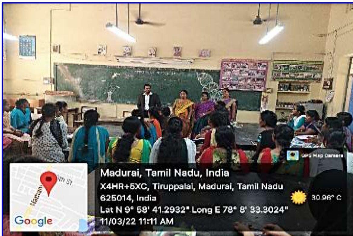
Guest Lecture on "Job Opportunities in Medical Coding" - 11.03.2022