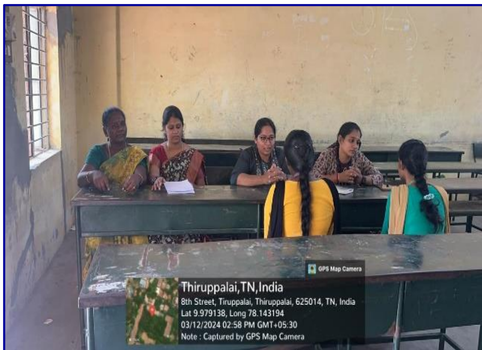
The Placement Cell, EMGYWC organized a Campus Drive on 12.03.2024