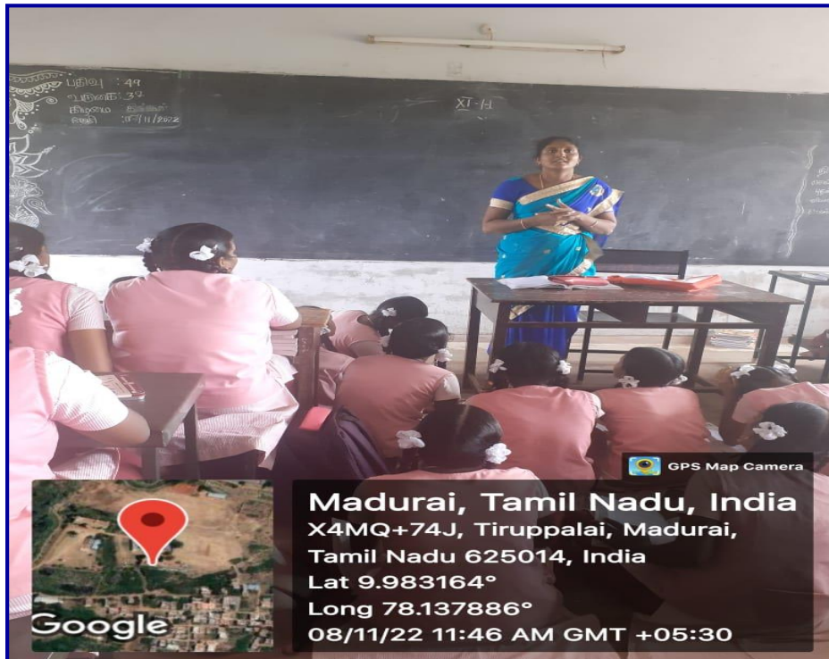
Extension Service at Sri Ram Nallamani Yadava Girls Higher Secondary School, Madurai on 8.11.2022