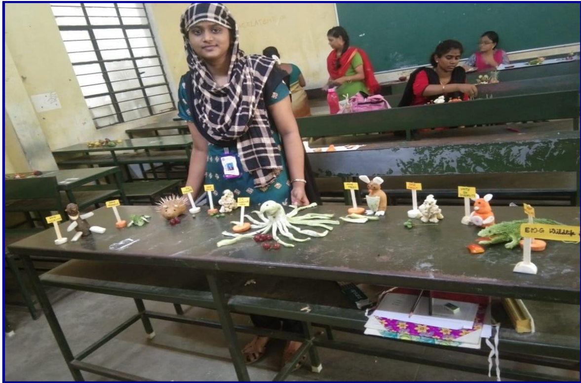
The intrinsic Vegetable Carving by a student