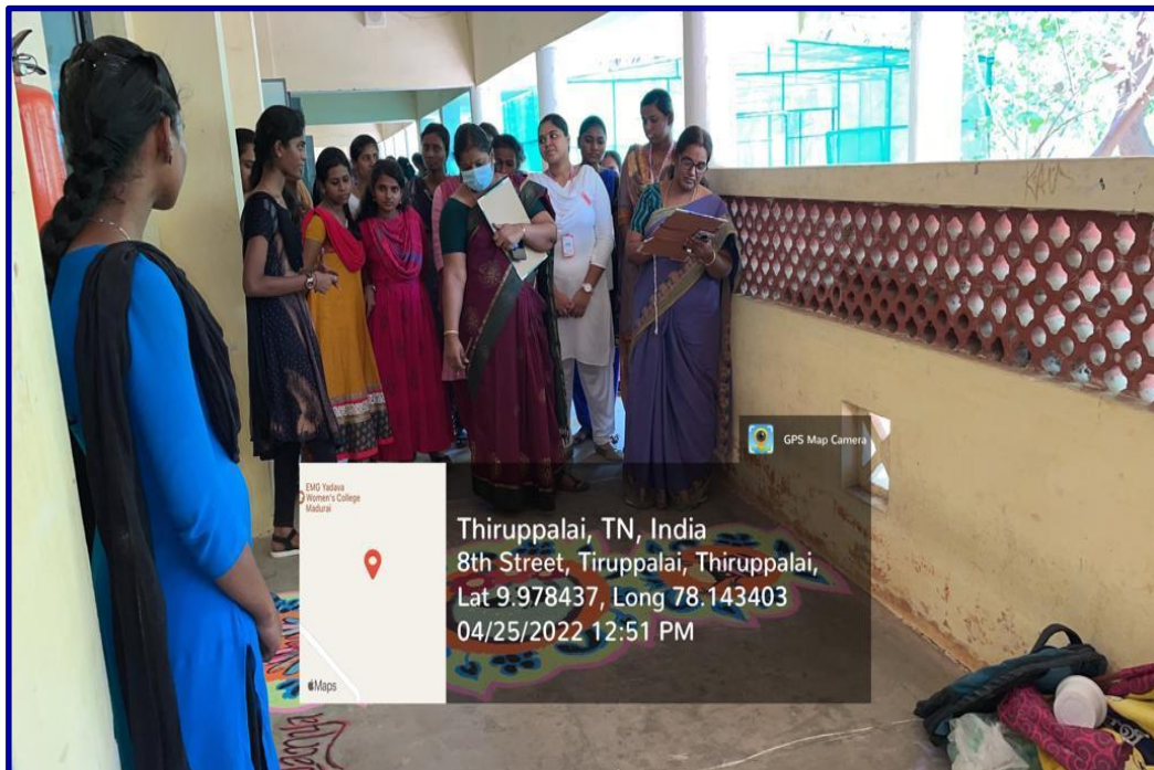
The Jury of Rangoli for Youth Talentia 2022