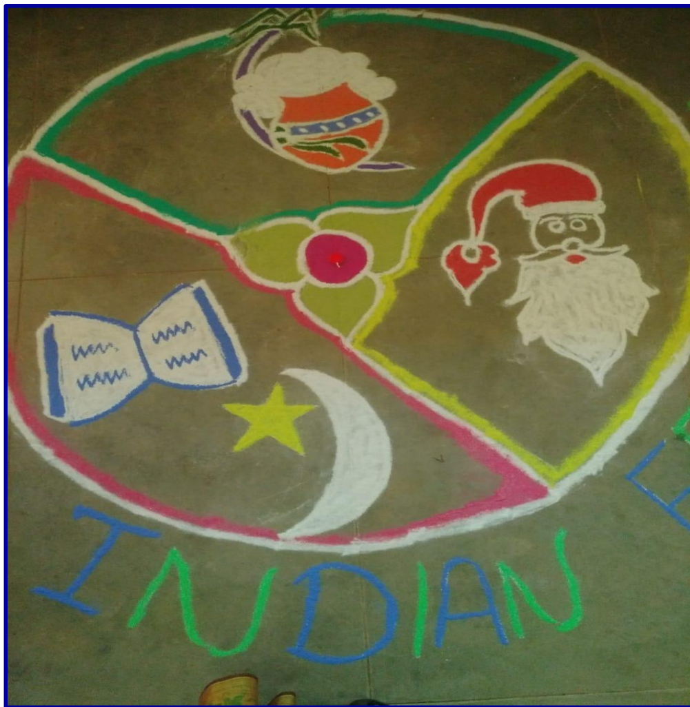
The colourful Rangoli Presentation by the students for Youth Talentia 2022.