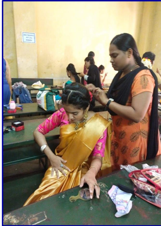
Students involving themselves with passion for Hair-Do Competition for Youth Talenta