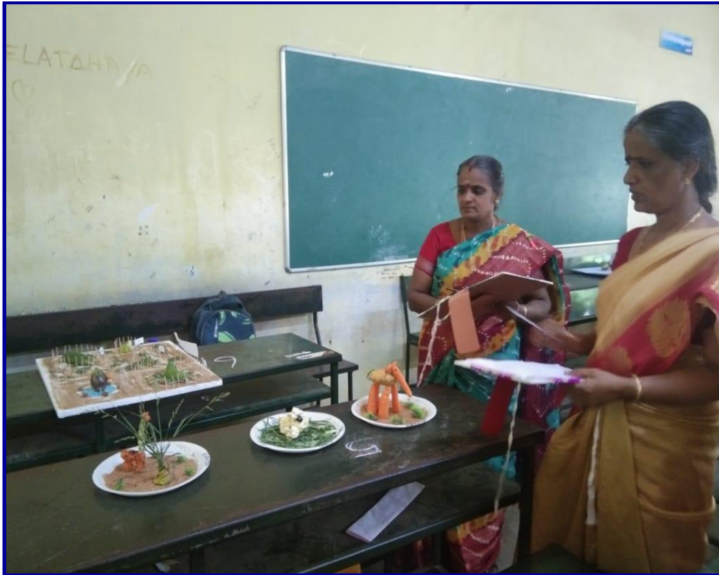
The Jury of vegetable carving for Youth Talentia 2022 is evaluating the students' skills.