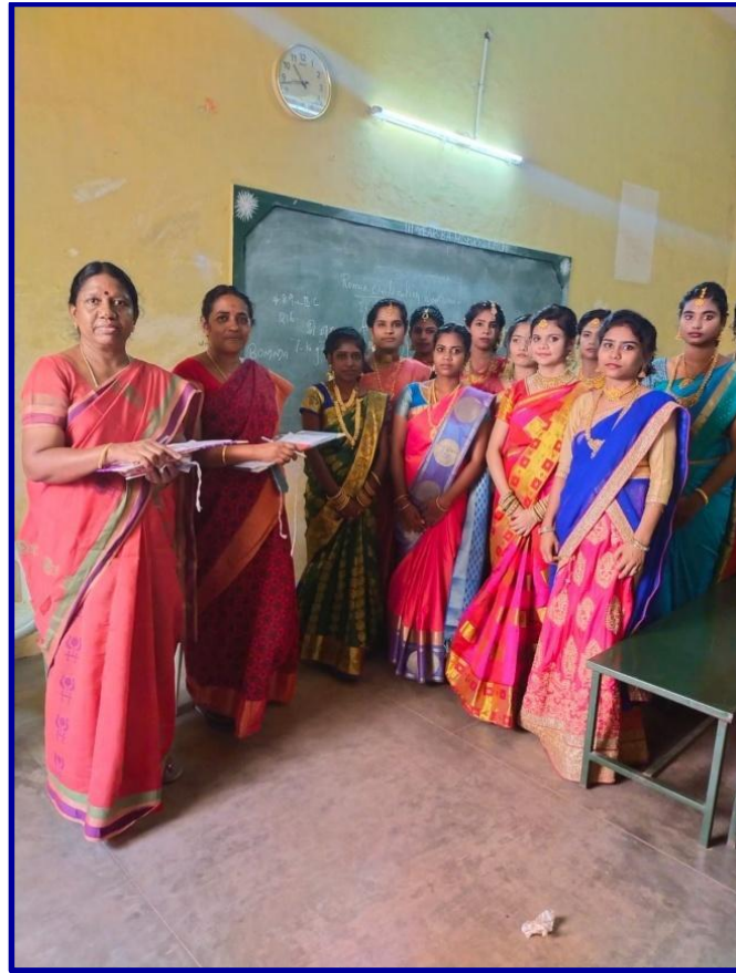
The Jury of Hair Do for Youth Talenta Off Stage Events 2022 is evaluating the students' skills.