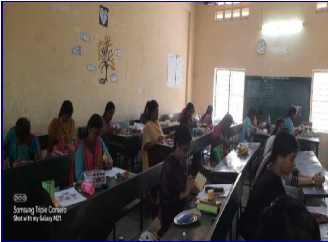
Students involving themselves with passion for Art from Waste Competition for Youth Talenta