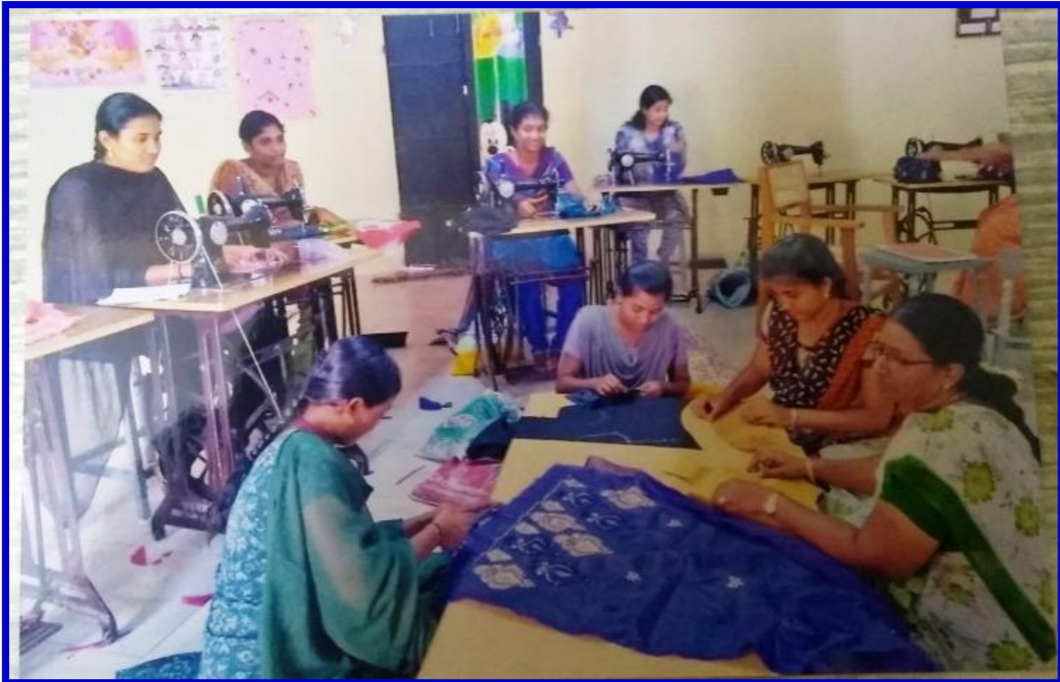
TAILORING COUSE 12.07.2022 to 20.03.2023

By the end of the course, students gained foundational knowledge of fashion trends, garment design, and the practical application of sewing machines, preparing them for entry-level roles in the apparel and fashion industry. They are now proficient in basic garment creation and familiar with the tools and techniques used in tailoring.