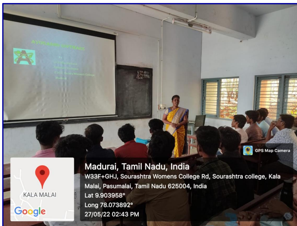
Workshop on “Avogadro Software – 27.05.2022”