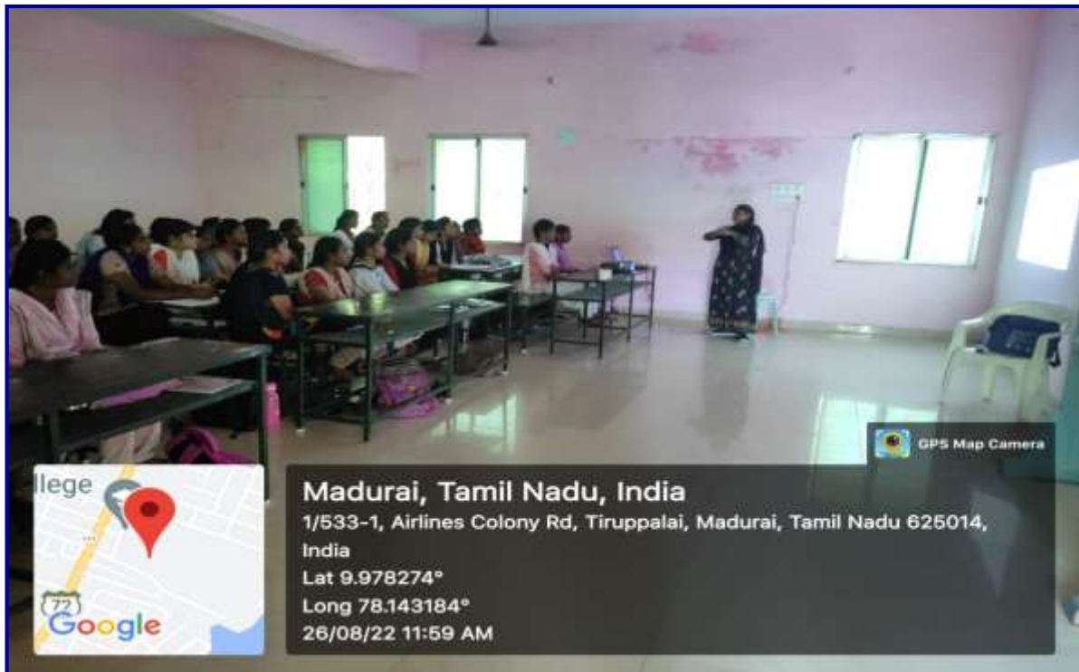
The Department of Computer Applications organized a Seminar entitled "Cyber Security" - 26.08.2022