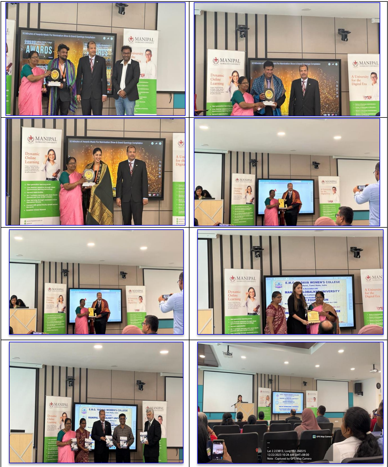
Interdisciplinary Insights: E.M.G Yadava Women's College, Manipal Global NXT University, Malaysia & Primax Foundation, Bangalore, jointly organizes International Conference on "Multidisciplinary Innovations in Education, Social Sciences, Humanities and Business" at Malaysia on 22.12.2023