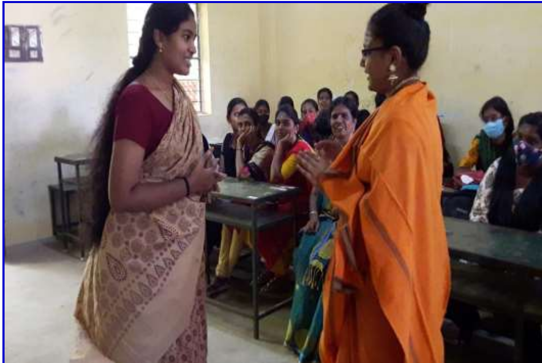
Department of Tamil has Organized Drama on “Thai Thediya Saei (Mother Sought Child)” -23.12.2021