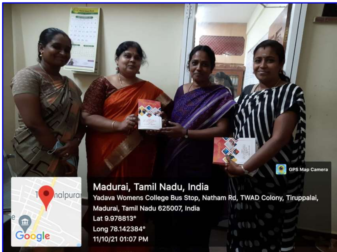
Consultancy Activity: Income Generated by the Department of BBA, EMGYWC, through Sale of the Book entitled "Counselling" - 22.11.2021