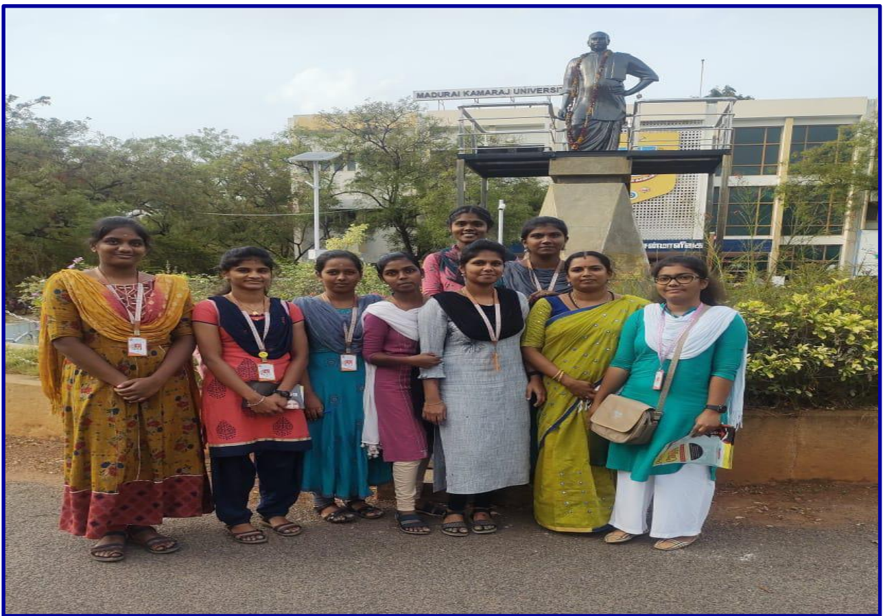
Student Participation in Seminar on “Study in Canada and get a Job Opportunity” organised by Madurai Kamaraj University , Madurai- 21.03.2023