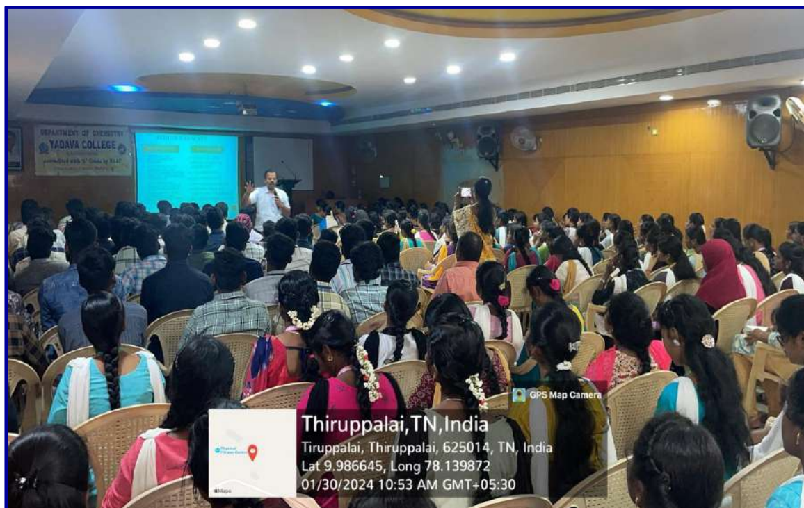
SEP entitled "Career Guidance for Chemistry Graduates in Central Government Jobs" @ Yadava College, Madurai- 30.01.2024