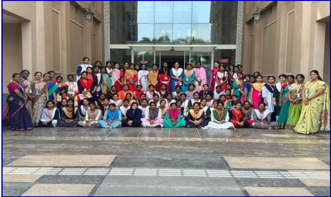
The Placement Cell, EMGYWC organized an Industrial Visit to HCL Technologies, Madurai - 18.10.2023