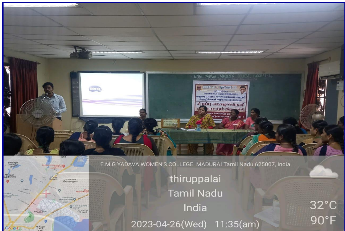
An Awareness Programme on "SSC - Combined Graduate Level Examination" - 26.04.2023