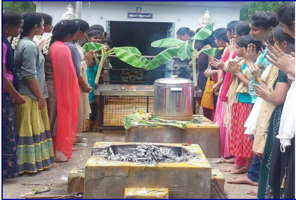
Pooja Celebration on 20.10.2023