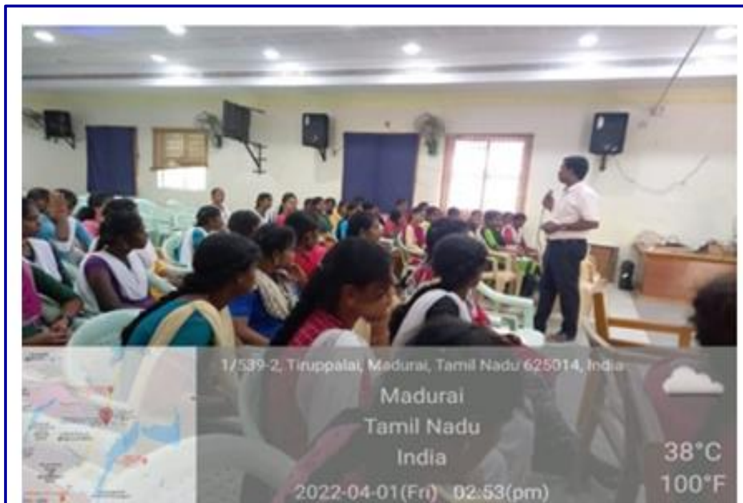
Faculty Exchange Program entitled “Research Methodology in History” - 01.04.2022