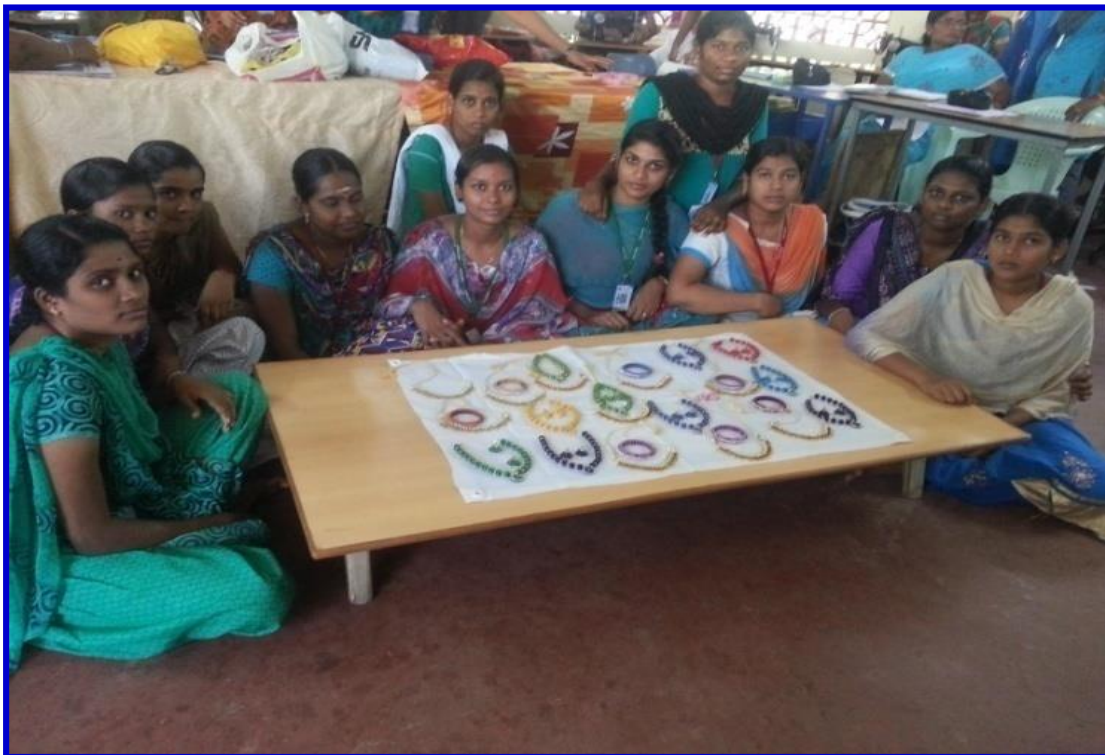
AARI EMBROIDERY WORK 12.07.2022 to 26.03.2023

By the end of the course, students had gained a practical understanding of Aari embroidery and were capable of creating intricate, beautiful designs suitable for blouse embellishments. The program enriched their artistic skills and opened opportunities for personal projects or small-scale entrepreneurial ventures.