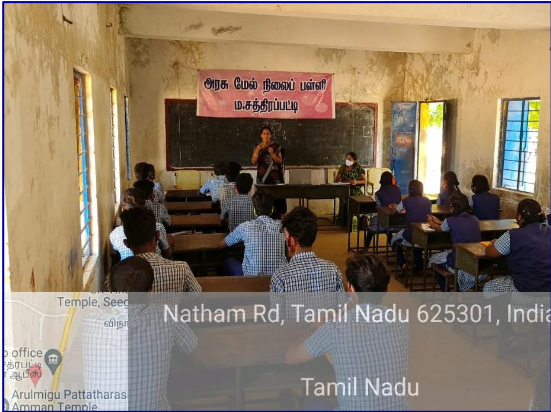
Extension Activity at Government Higher Secondary School, entitled "Significance of Freedom Struggle" - 09.09.2021