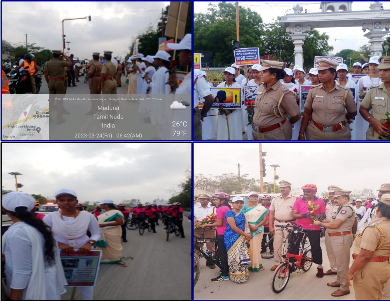
NSS, EMGYWC organized a Cycle Rally -"Crimes Against Women" at Othakadai on 24.03.2023