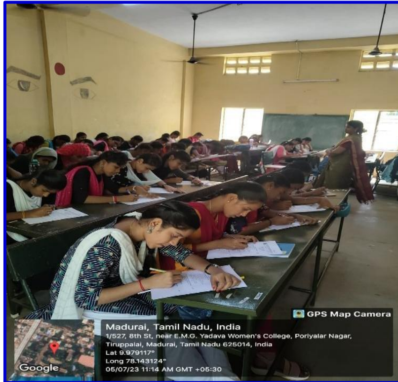
Entry Level Test - 05.07.23