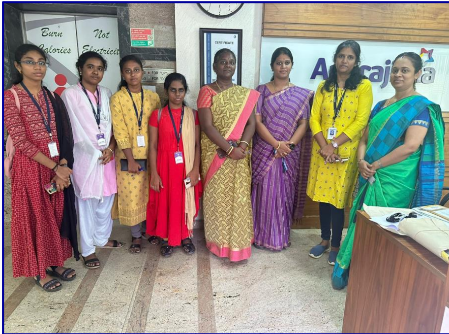
Students of EMGYWC attended an Interview at Aparajitha Corporate Services Pvt. Ltd. on 11.09.2023