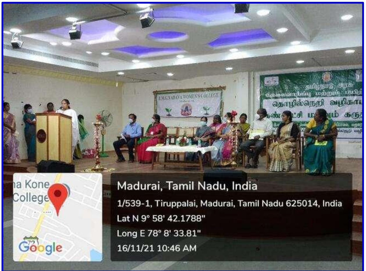
Job Awareness Programme on "Career Guidance for Women"-16.11.2021