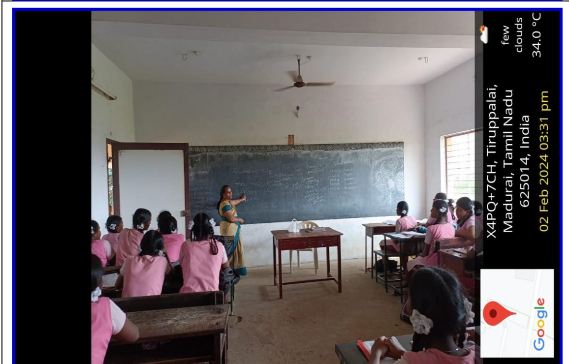
Department of Commerce, EMGYWC, has extended their service to Sriram Nallamani Yadava Girls Higher Secondary School, Madurai, entitled “Commerce and Accountancy” - 02.02.2024