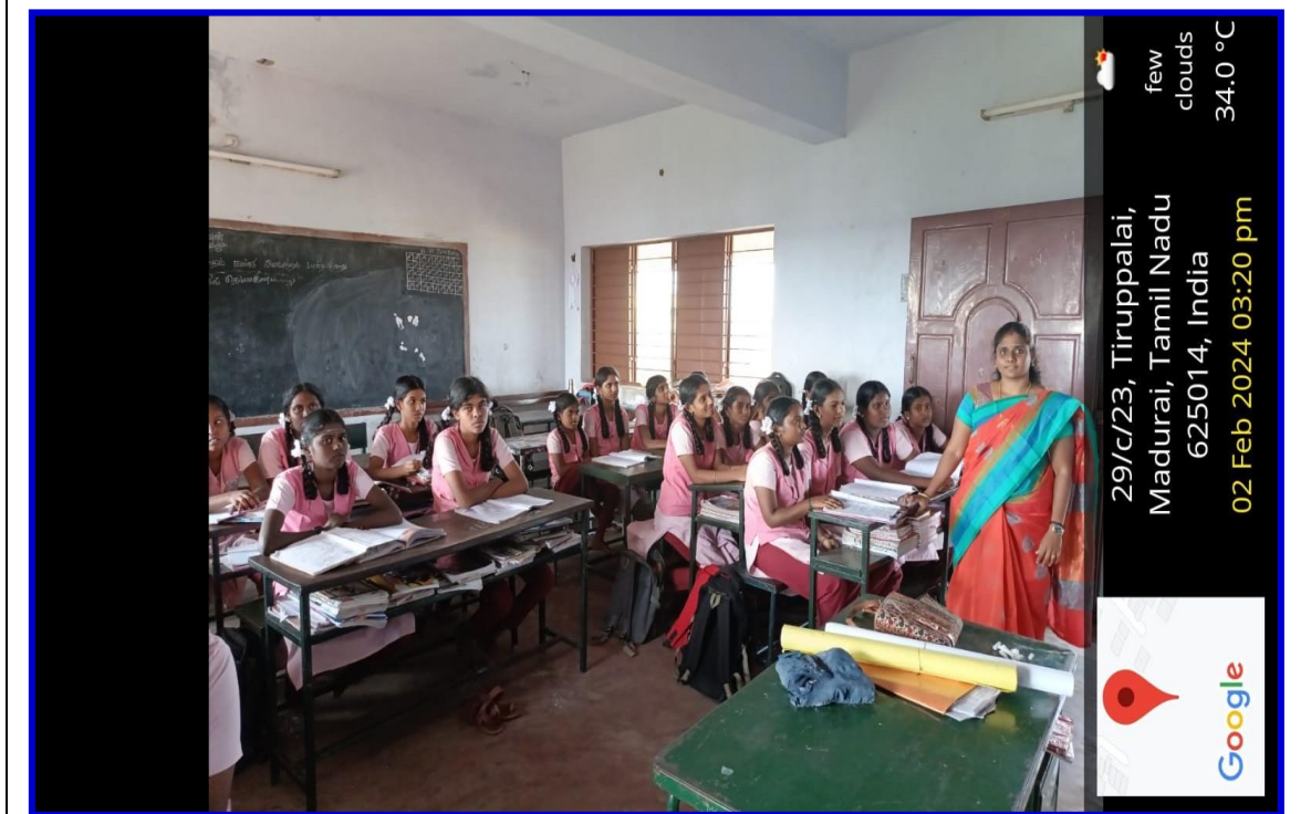
Department of Commerce, EMGYWC, has extended their service to Sriram Nallamani Yadava Girls Higher Secondary School, Madurai, entitled "Commerce and Accountancy" - 02.02.2024