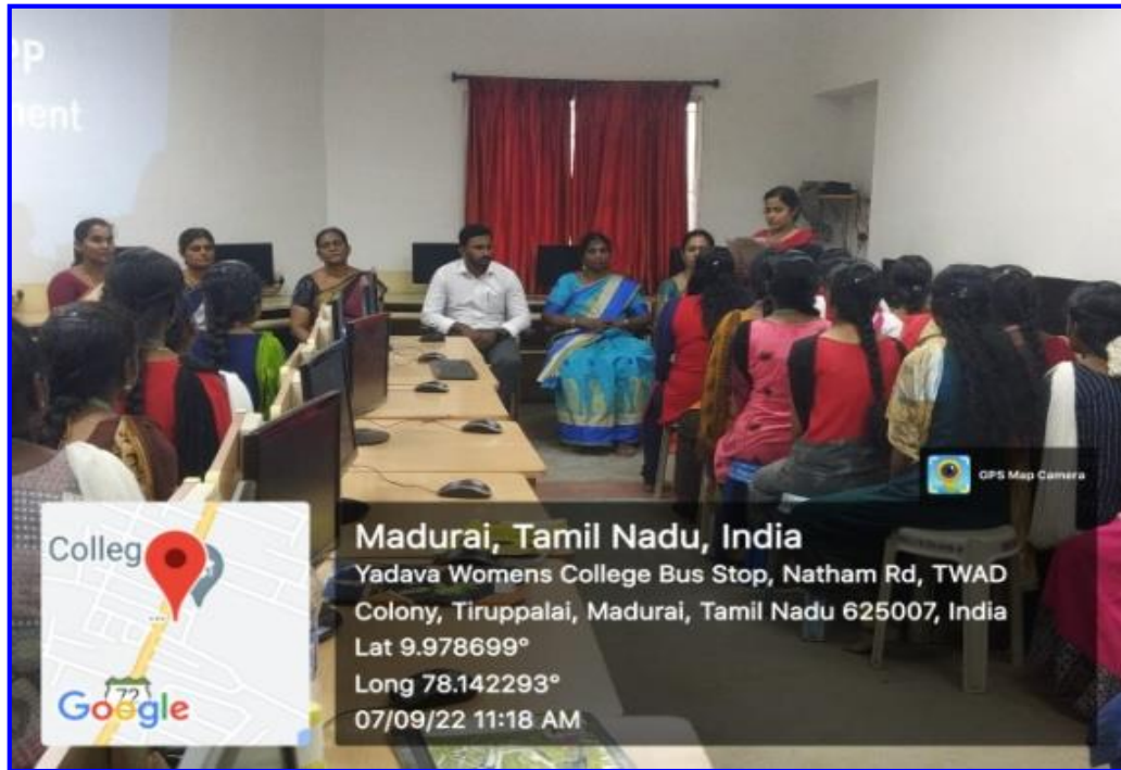
The Department of IT organized a Workshop titled "Web & App Development" on 07.09.2022