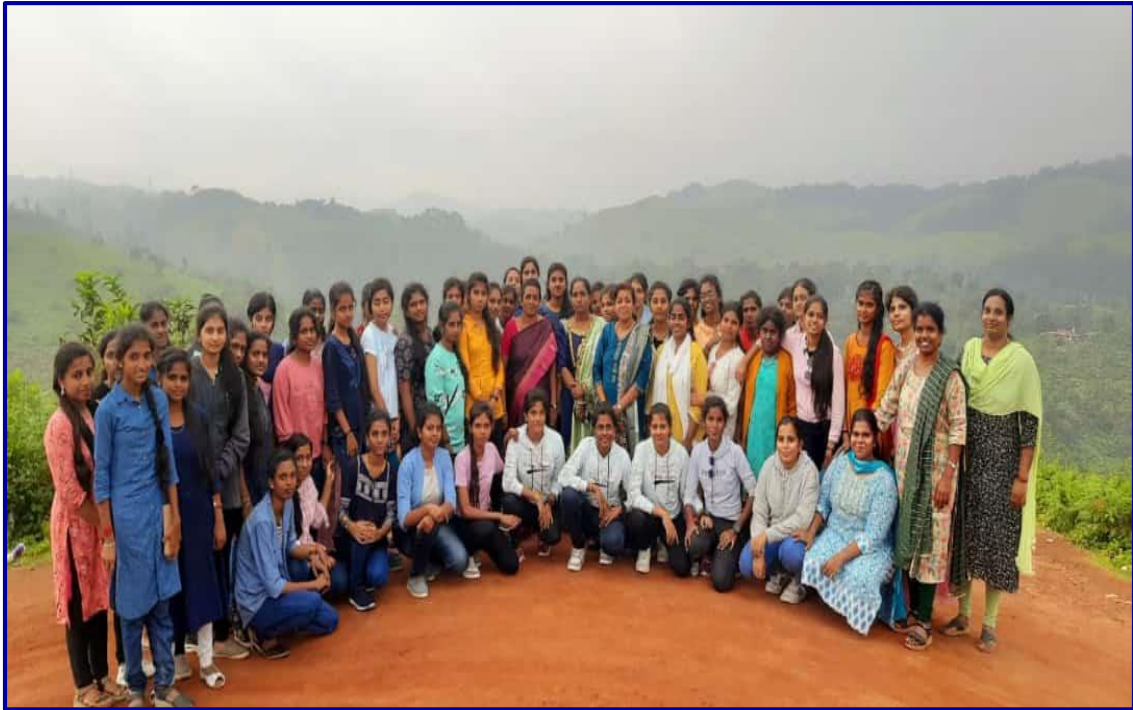
The Department of BBA organized an industrial visit to POABS Tea Factory, Krambi, Kerala, on 18.10.2023.