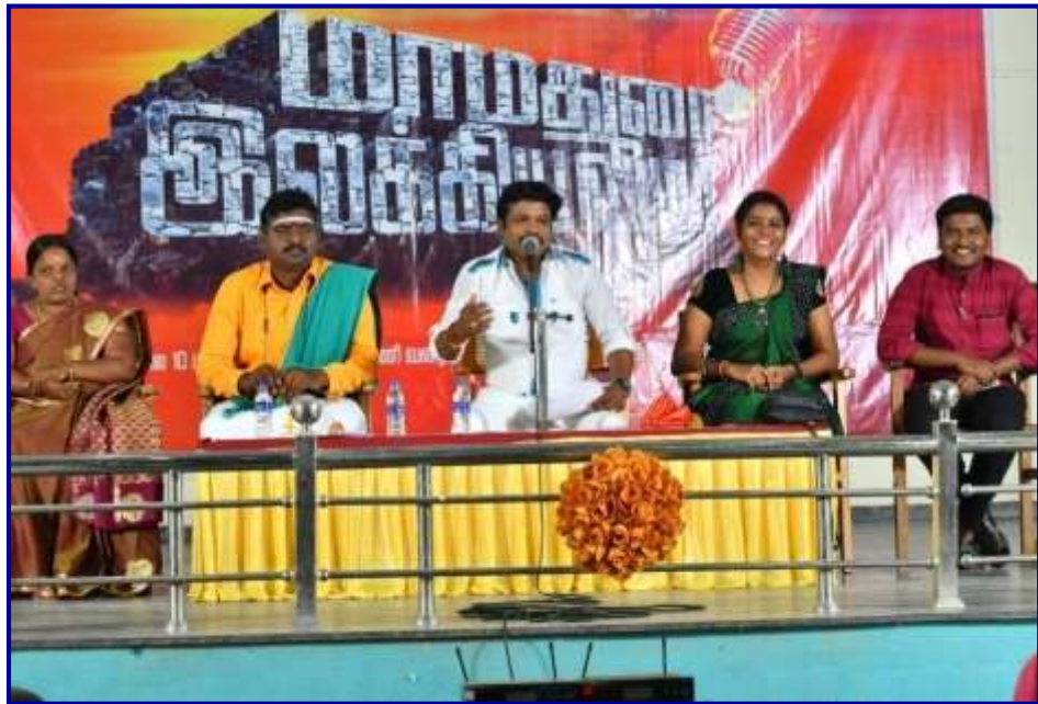
The Department of Tamil Organized "Madurai Literary Festival" on 05.08.2022