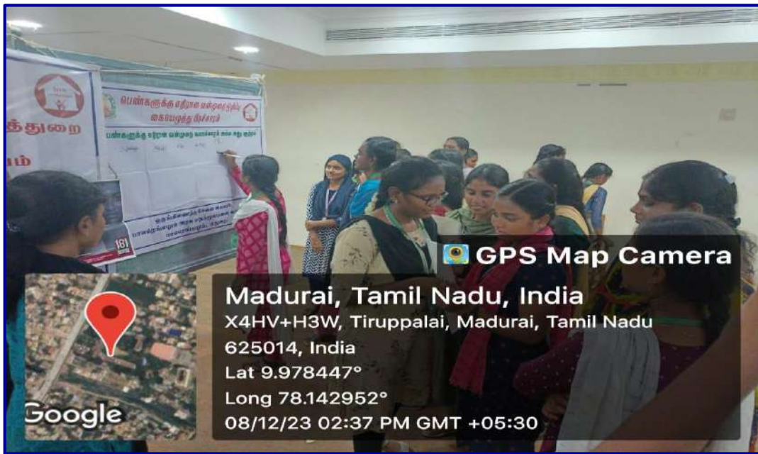
NSS team of EMGYWC organized an Awareness Programme entitled "Violence Against Women" on 08.12.2023