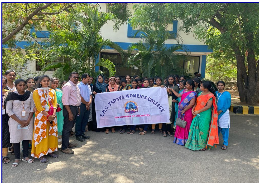
Industrial Visit: Department of Chemistry has visited the Abilash Chemicals Pvt. – Ltd., Madurai, and learned the “Manufacturing of Metformin Hydrochloride Tablets” on 13.05.2022