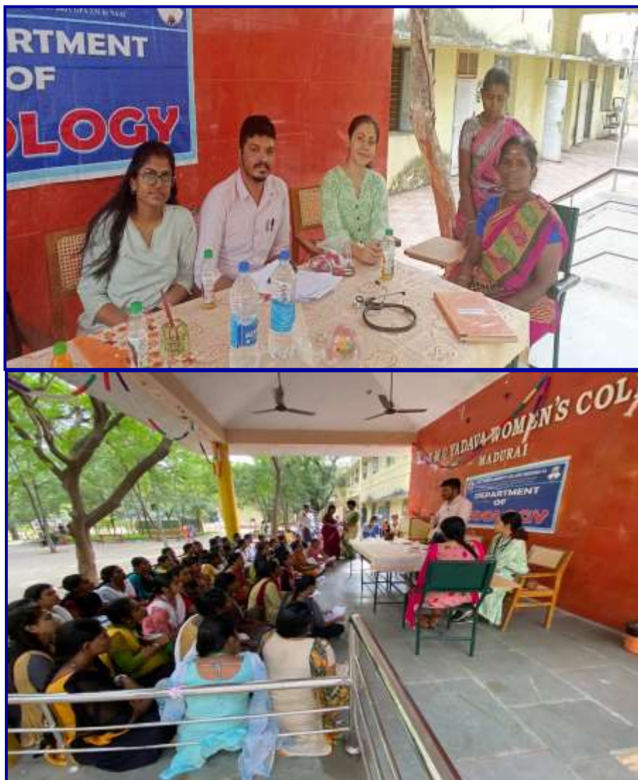
Free Consultancy Activity “Analysis of Thyroid Hormone and Awareness Lecture” – 06.01.2023