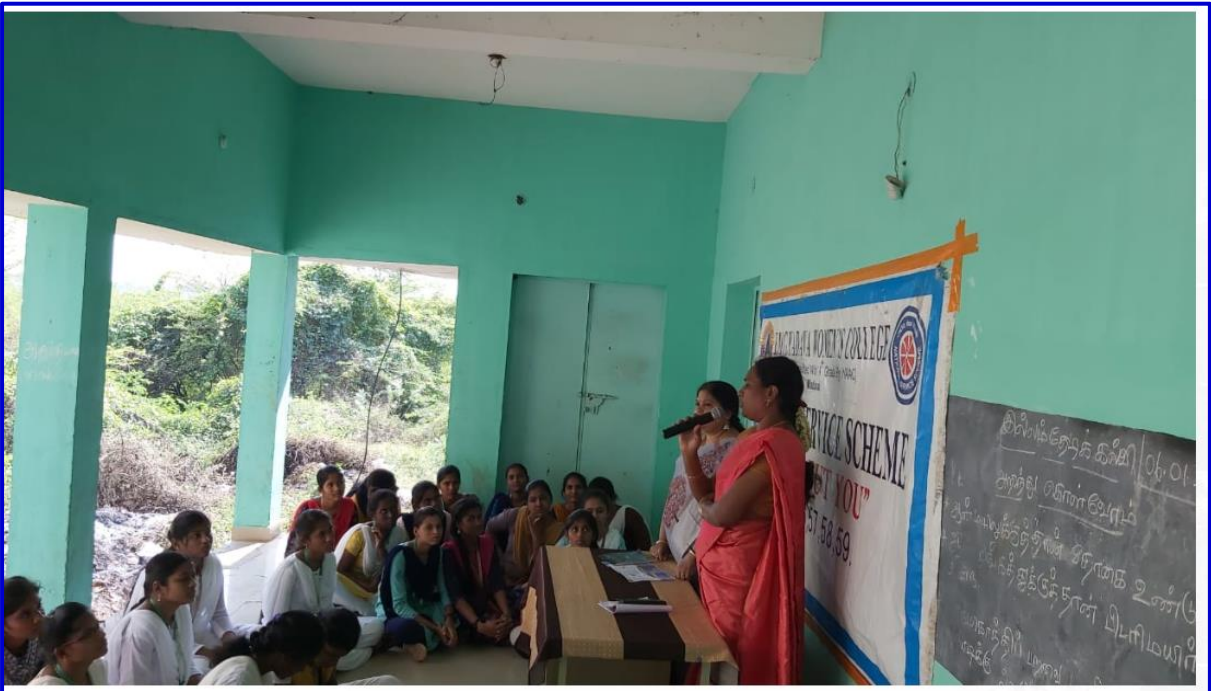
Extension Service on 10.01.2023: Demonstration of Azolla Cultivation and Awareness Program on Personal Hygiene for Women conducted at Karuvanoor, Madurai, by the Department of Zoology - Botany, in association with NSS EMGYWC and supported by Allathor and Yeran Foundations.