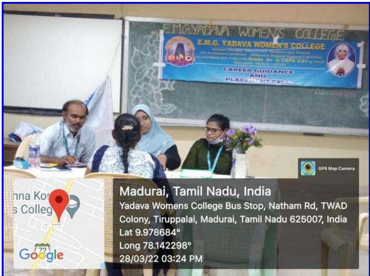
Recruitment for Software Designer - 28.03.2022