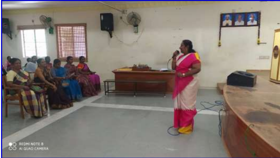
Association Meeting entitled "Reduce the Risk of Heart Diseases" - 29.09.2022