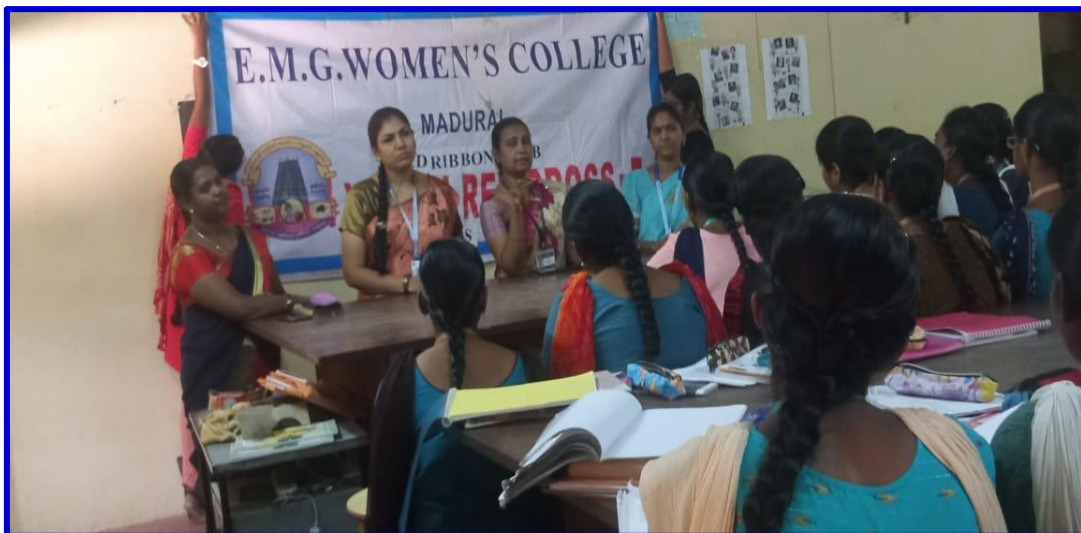
YRC & RRC of EMGYWC, conducted State Level Online Quiz Competition (Awareness Programme) - 10.08.2022