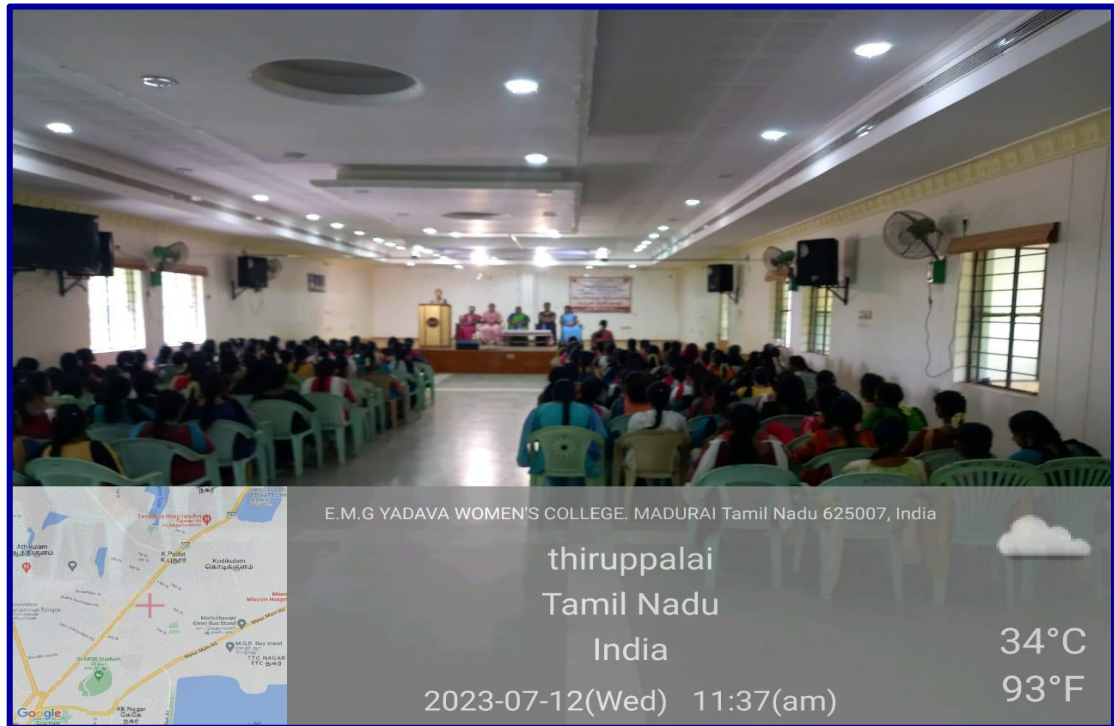
Workshop on “Career Guidance and Skill Training for Women Empowerment” - 12.07.2023