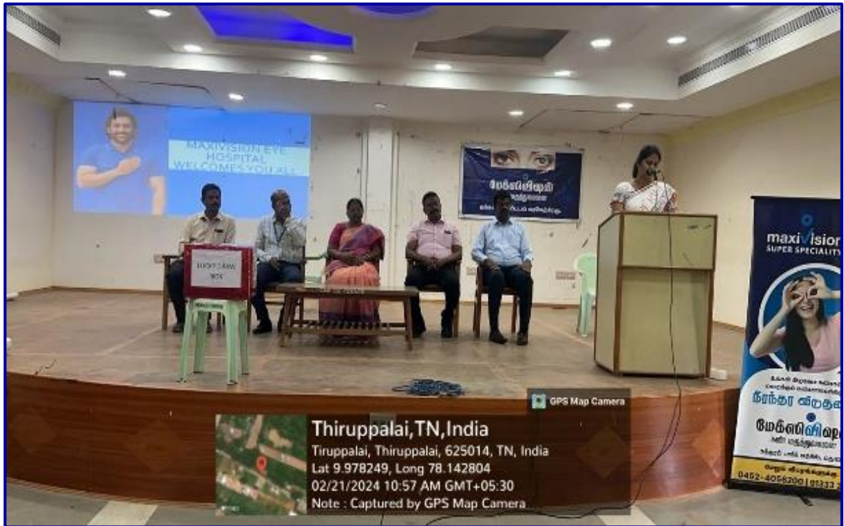
The Placement Cell, EMGYWC organized Workshop on “Better Vision is our Responsibility” in association with Maxi Vision Eye Hospital, Madurai – 21.02.2024