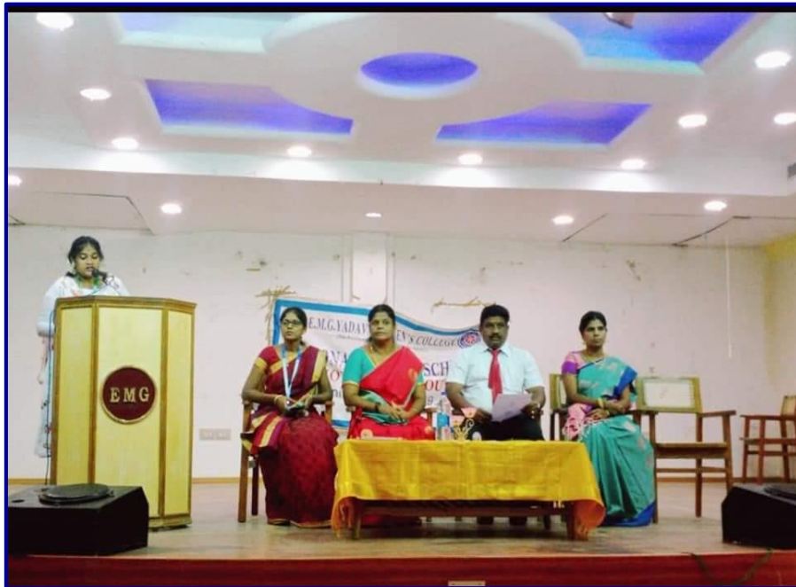
The NSS, EMGYWC organized an Orientation Programme on 21.11.2022