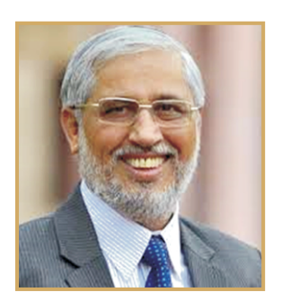
Anil D Sahasrabudhe Chairman, AICTE

I am very happy to see that the detailed guidelines have been issued by Ministry of Human Resource Development on National Innovation and Startup Policy for students and faculties of higher education institutions which further strengthens the Startup Policy released by All India Council of Technical Education in November 2016 from Rashtrapati Bhawan, just after few months of Startup action plan announced by the Government of India in January 2016.