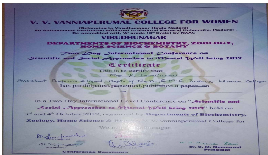
Scanned by TapScanner