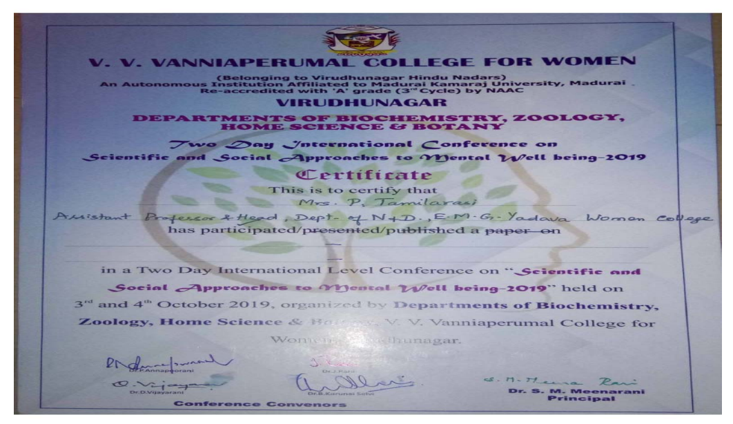
Scanned by TapScanner