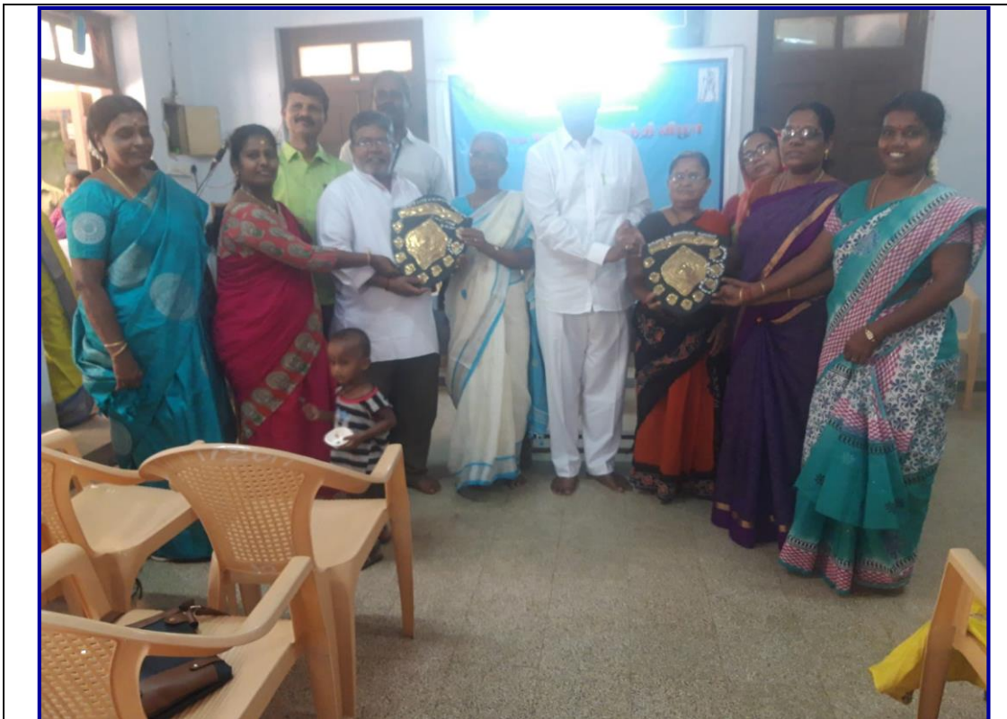
Rolling Shield for Gandhian Thought Examination 2023

This course was conducted under the control of Madurai Kamaraj University. During the pandemic period, some of the practical difficulties faced are issuing hall tickets, receiving answer scripts, receiving certificates through postal mode.