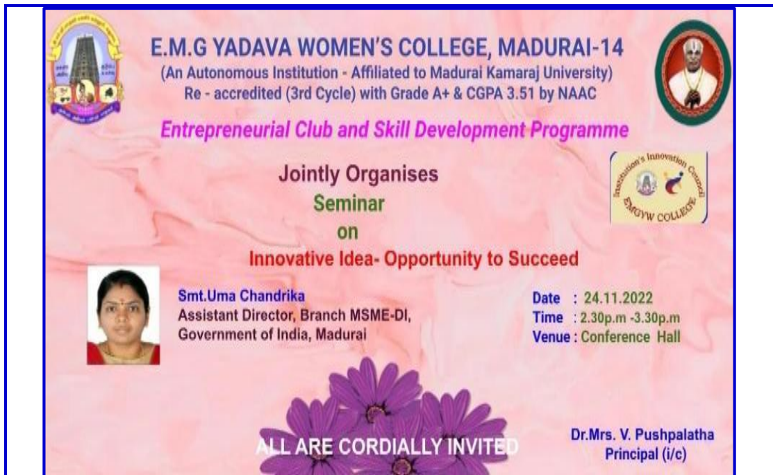
Entrepreneurial Club and Skill Development Cell, EMGYWC organised a Seminar on “Innovative Idea-Opportunity to Succeed” - 24.11.2022